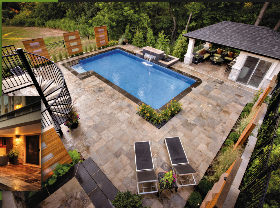
S. REBELO LANDSCAPES INC Winner of the Dunington-Grubb Award

Celebrating excellence in Landscape Construction, Maintenance and Design