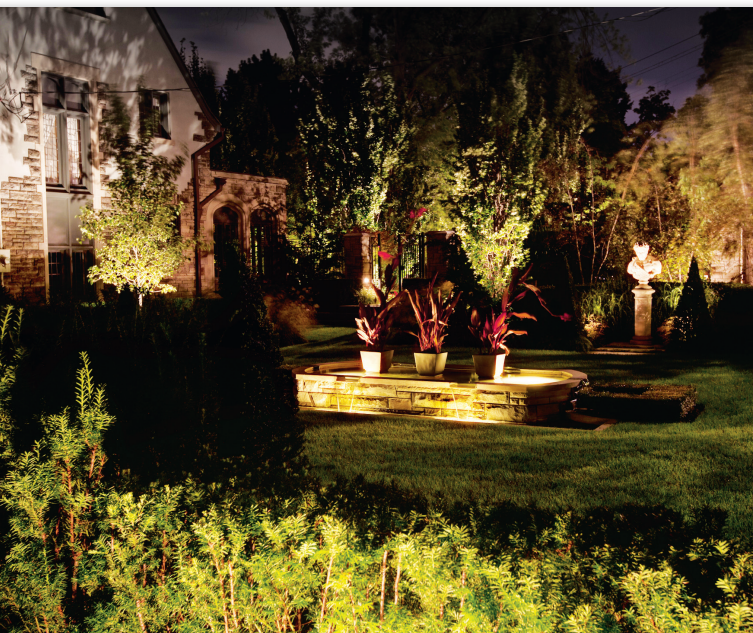
MOONSTRUCK LANDSCAPE LIGHTING Landscape Lighting Design and Installation

Residential Construction - $100,000 - $250,000